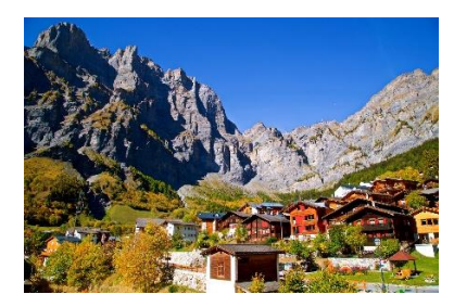
The spa resort of Leukerbad

The Reichenbach Irregulars of Switzerland are delighted to announce a new conference due to take place from Thursday , 1 <sup>*</sup> June to Sunday , 4 <sup>th</sup> June 2023 in the relaxing alpine spa resort of Leukerbad which is a spectacular 5 minutes' cable car ride away from the dramatic Gemmi Pass and the "melancholic Daubensee" , both key locations in The Final Problem .