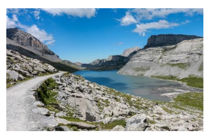
the "melancholic Daubensee"